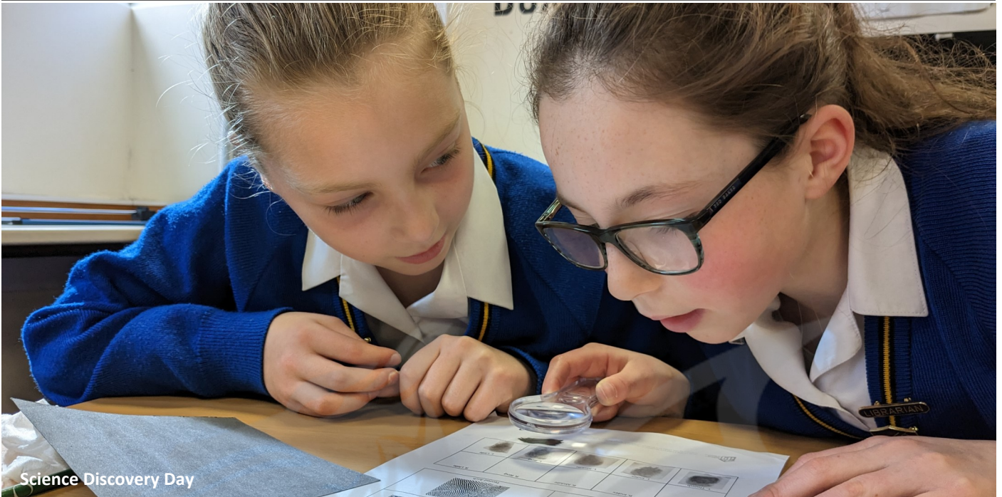
Science Discovery Day

It has been a busy week here in the Prep School filled with many exciting activities and events. We kicked off the week with our Science Discovery Day, where students had the opportunity to participate in a range of STEM challenges relating to the theme of 'connections'. They had a fascinating virtual reality experience, wandering through animal habitats, and a fun fingerprint exercise, among other activities which you can read more about in the following pages. We were delighted to be joined by many prospective families interested in the school, and we look forward to seeing them return for further taster days in the coming weeks.