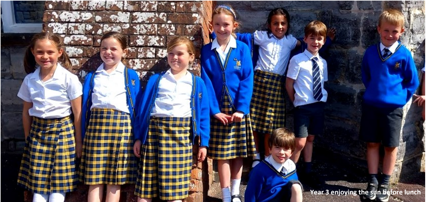
Year 3 enjoying the sun before lunch

I hope you had time to enjoy the extended weekend and some of the celebrations for the King's Coronation. This has been a short but eventful week in the Prep School and there is plenty to read about in the following pages.