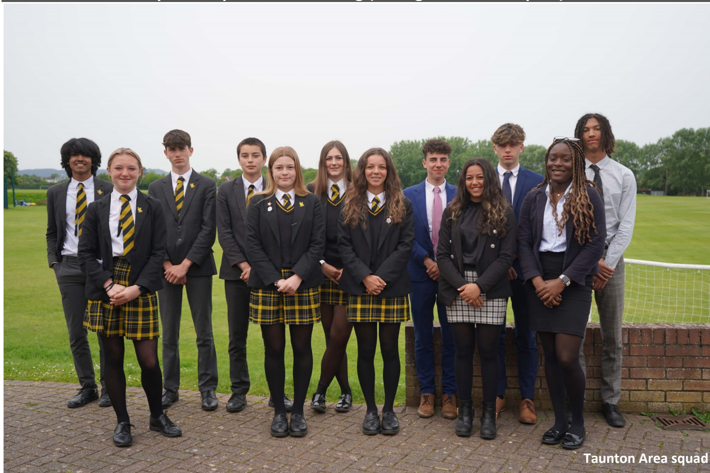
Taunton Area squad