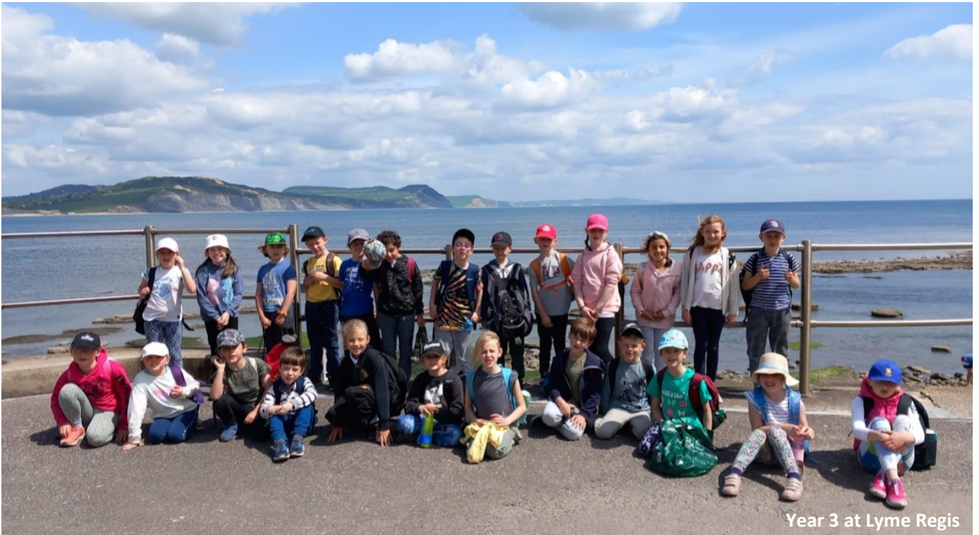
Year 3 at Lyme Regis

all pupils continue to develop a love of reading.