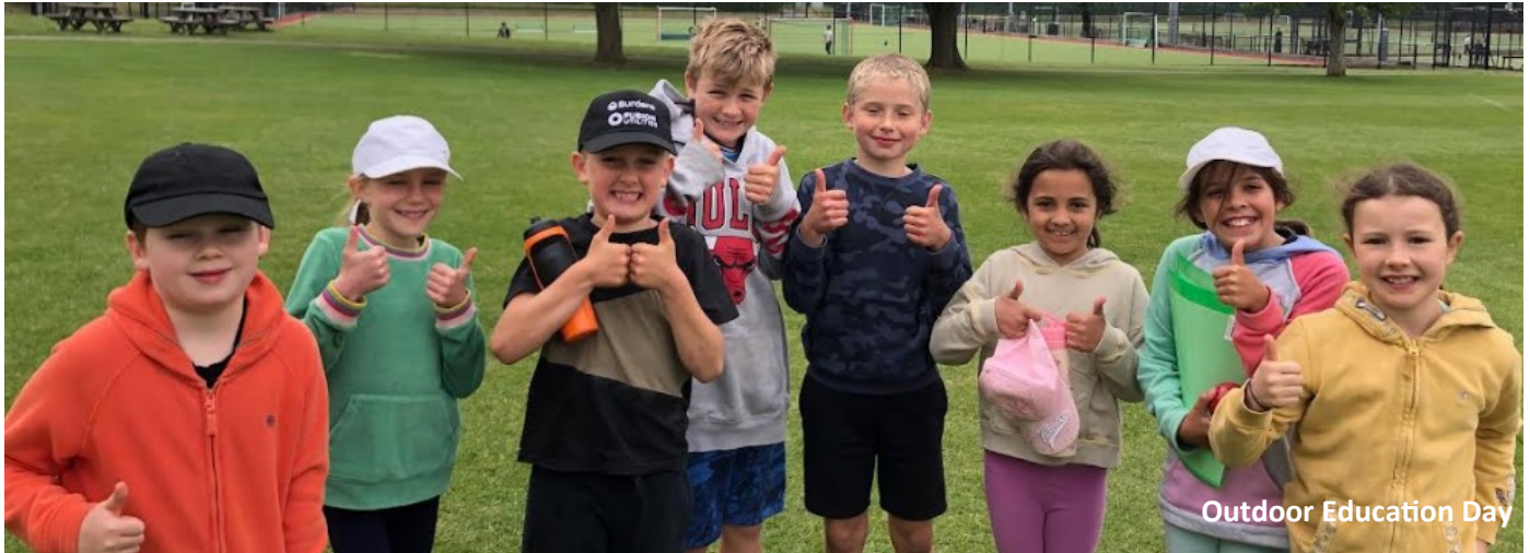
Outdoor Education Day

Welcome back, everyone! I hope you all managed to enjoy the good weather over the half term break - we are ready to dive into the final four weeks of the school year. We certainly hit the ground running this week, with lots of exciting events and activities taking place. I am also pleased to say that everyone has settled back in brilliantly after the half term break. As ever, the children have returned with enthusiasm and a positive attitude towards school. I hope you enjoy reading about the many successes this week in the following pages.