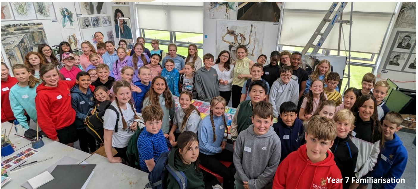
Year 7 Familiarisation