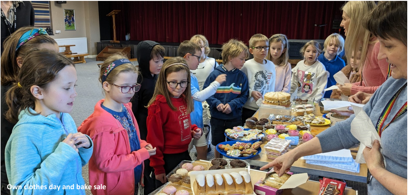
Own clothes day and bake sale