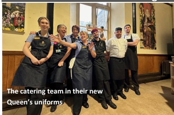
The catering team in their new Queen's uniforms

Our catering is no longer operated by the contractor Holroyd Howe and from 1 January we are back 'in house' and the team are all directly employed by Queen's. We are all really pleased to be back in the fold, even though many of the team felt they never left. Focuses for this year is very much on continuing the drive for delivering restaurant quality meals for Queen's pupils, teaching staff and support teams.