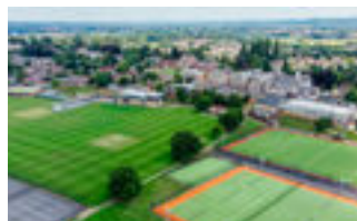
36 acres of land and sports pitches