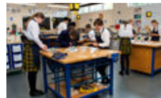
Small class sizes in well- equipped and purpose- built classrooms