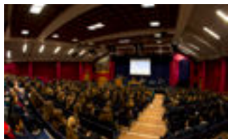
570 Seat Theatre (largest in the region)